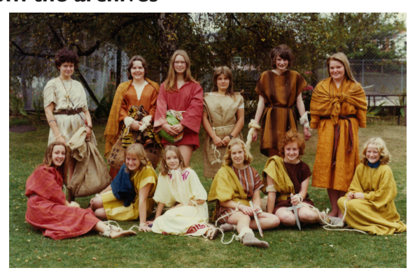
Androcles and the Lion production 1977