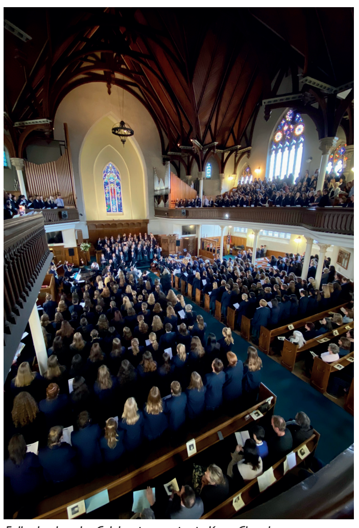
Full school at the Celebration service in Knox Church.